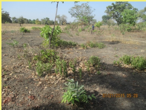
The S.E.E.D Project