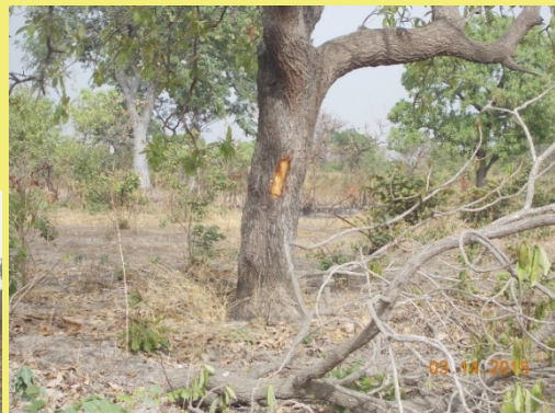
The Faith - Farm